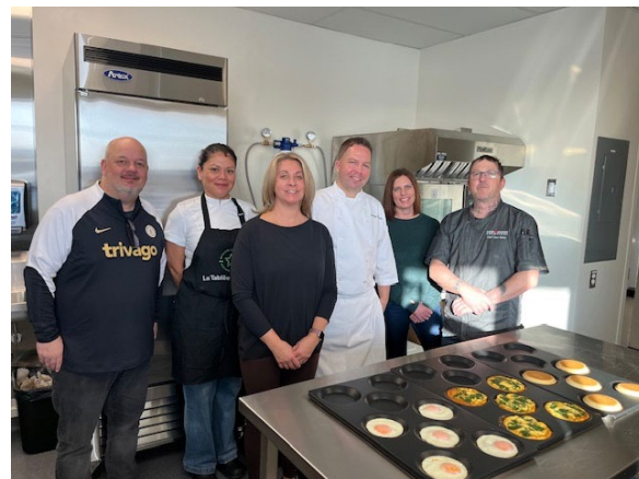
Our team being trained on the new oven.