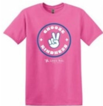
Item 1- Peace Sign

English: https://louisriel.schoolcashionline.com/Fee/Details/6749/516/False/True