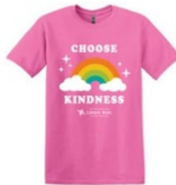
Item 2 - Rainbow