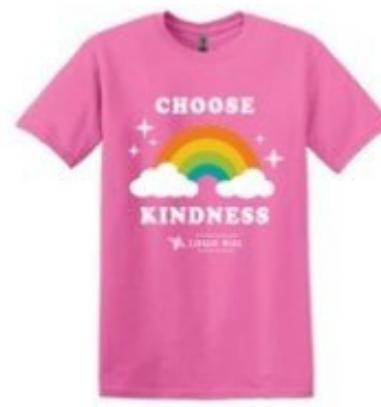
Item 2 - Rainbow