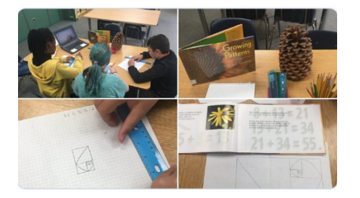
Our dreams are inspired by a fascinating book about patterns in nature.