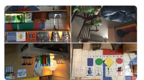
Zones of Regulation