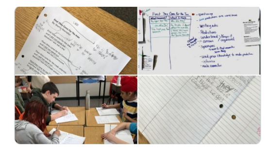
Talk to the Text and then transferring thoughts and evidence to a double entry journal in Grade 5/6.